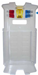
Clear Cover Underneath Side